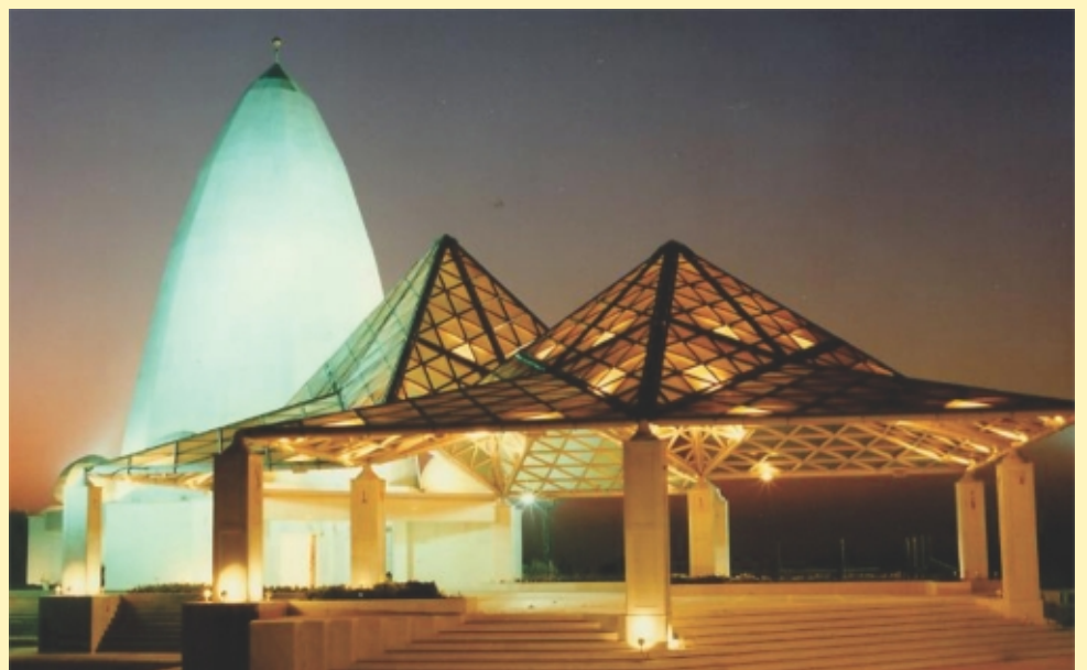
Birla Temple At Alibag Designed By : C. B. Sompura

As far as design is concerned, let me say that given site conditions, you can have 500 different designs without Vaastu and also 500 designs with Vaastu. It is not entirely true that Vaastu is rigid. Vaastu confers on the architect the task of putting into practice what it prescribes. In spite of the constraints by which Vaastu seems to limit the architect, it is also true that Vaastu gives considerable latitude in the architectural parts as also in the appearance that the construction may have. As Vaastu seeks to encompass all possible circumstances, it allows an extended series of specific variations