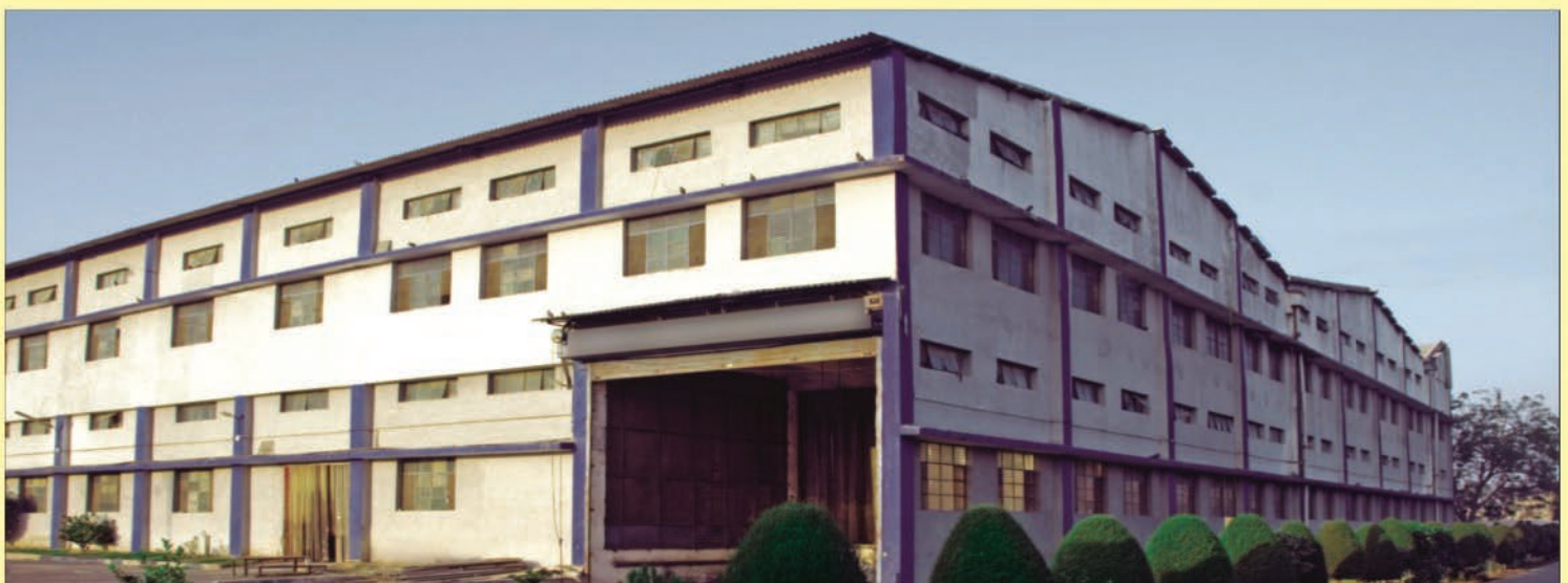
The Shakti and Jagdamba Polymers Works at Dholka